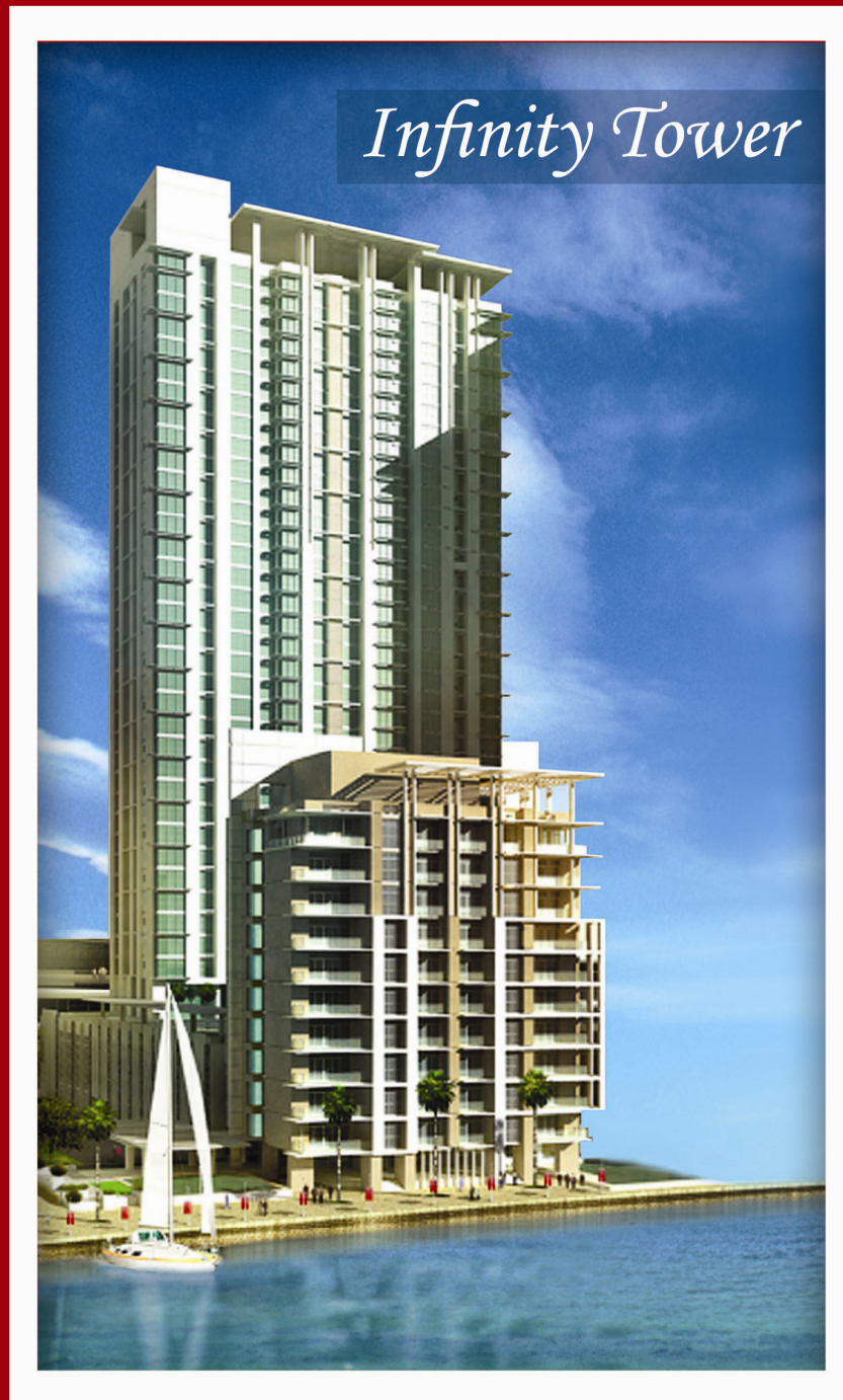
Phase 1, Plot 1 - Marina Square - Reem Island